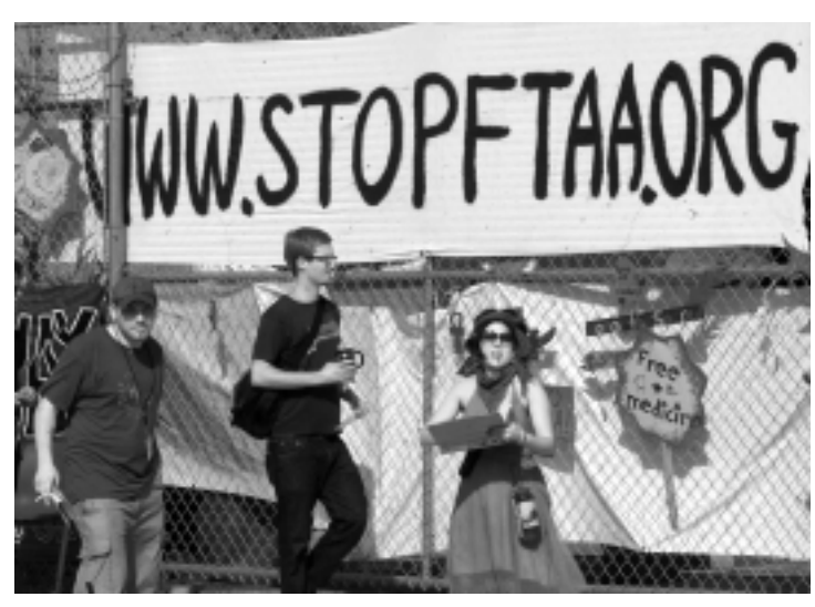
Demonstrators protest at a November 2003 meeting of the Free Trade Area of the Americas in Miami, Florida.

Bhagwati questioned whether imposing trade sanctions to redress nontrade concerns is the best policy option. Because it is very difficult for poor countries to "throw stones at big ones," such an asymmetrical response becomes resented and counterproductive. Moral suasion and boycotts, he argued, can be much more effective in advancing social agendas. At the same time, Bhagwati called upon international organizations to provide poor countries with adjustment assistance to help them cope with the downsides of trade liberalization. "The advanced countries have been doing it ever since Kennedy's time," he said, adding that "every trade act has had trade adjustment assistance drawn out." Bhagwati also felt that the transition to a more open trading regime should be managed with caution and that the speed on developing or improving policies to meet social agendas should be accelerated.