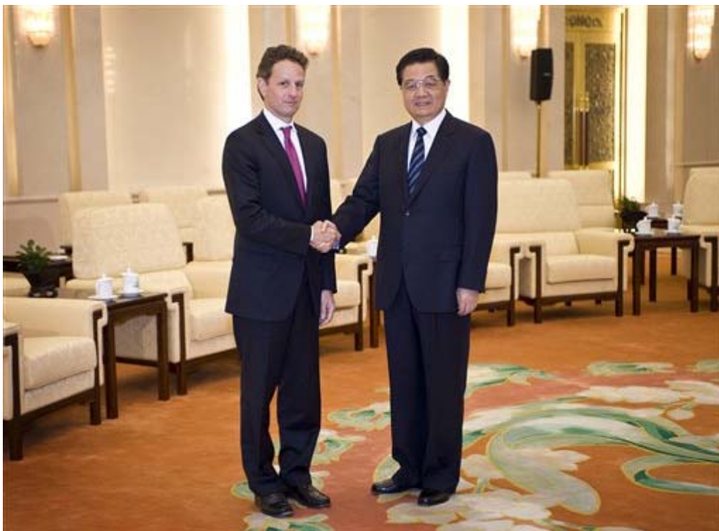
U.S. Treasury Secretary Timothy Geithner, left, shakes hands with Chinese President Hu Jintao upon arrival for a meeting at the Great Hall of the People in Beijing Tuesday, June 2, 2009. Geithner said Tuesday that he had found strong support among Chinese officials for the strategy the United States is employing to combat the worst global downturn in decades.