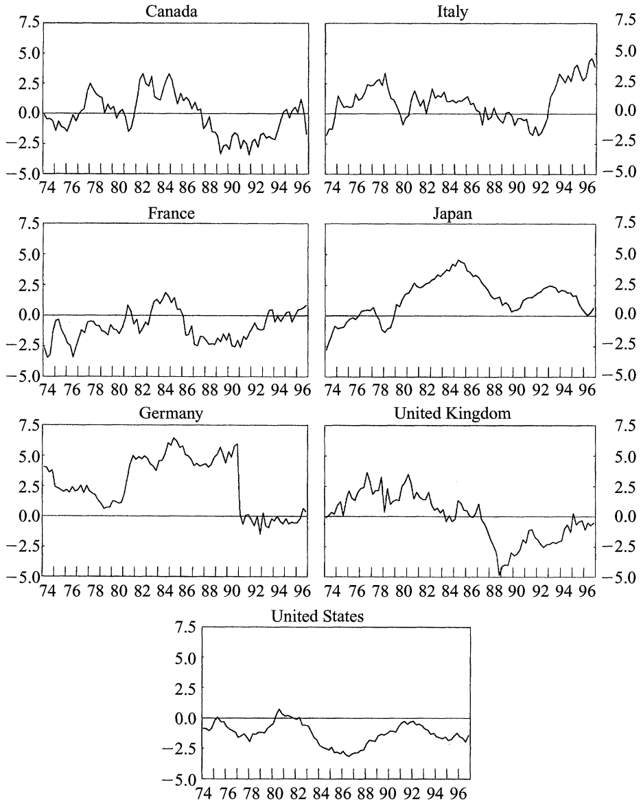
Fig. 1. The Ratio of the Trade Balance to GDP (%)

volatility in the trade balance than the other G-7 countries. It is also useful, especially from the perspective of interpreting cross-country differences in the empirical results, to examine the degree of openness to international trade. Table 1 reports time averages of the ratio of the sum of exports and imports to GDP. When the averages are broken down by decade, a clear rising trend in openness is evident for all countries over the last three decades, reflecting the increasing integration of national economies through trade.