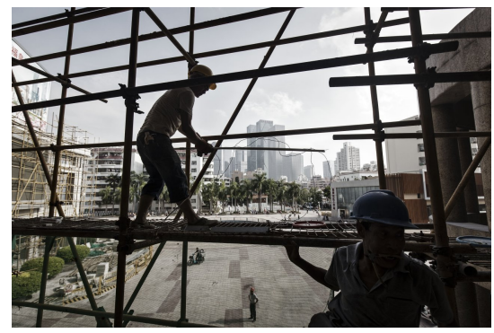
A construction site Shenzhen in September; real estate continues to be a major economic driver, even as the government tries to cool the housing market.

At a group discussion Thursday morning on the sidelines of the congress, central-bank Gov. Zhou Xiaochuan warned about the risk of excessive optimism. Ever-rising corporate debt, he said, could lead to a "Minsky moment"—named for the late American economist Hyman Minsky—in which asset prices collapse suddenly after a long period of economic growth.