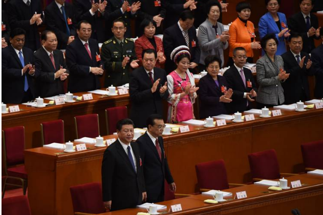
Chinese President Xi Jinping, left, stands with Premier Li Keqiang at the National People's Congress in Beijing in March.