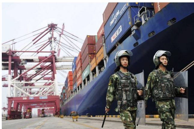
China's paramilitary police patrol a container port in Qingdao. China's exports rose in August as the country seeks to bolster growth.

“This is about much more than his age,” one of the officials said. “He was expected to serve full-term.”