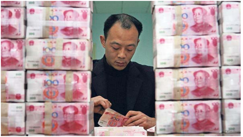
Great wall: a staff member counts renminbi at a bank branch in Suining in southwest China's Sichuan province

Most people from outside China have never used the renminbi for much more than buying trinkets at the Great Wall or steamed buns in a Shanghai eatery.