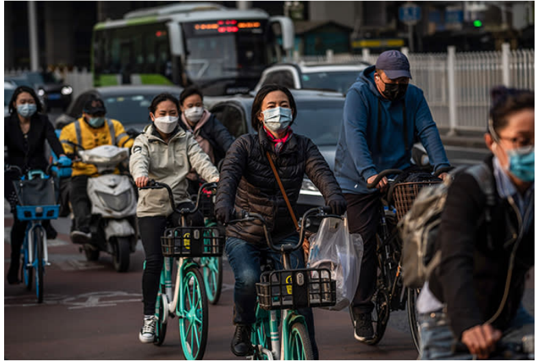
How Beijing fares in trying to restart economic activity without sparking a new round of infections will shape the response in much of the rest of the world

The nervousness is particularly evident in Wuhan. The city's "liberation" has in reality been only a partial one. Residents from other areas of China who were trapped there when the city was quarantined have been allowed to leave — provided they pass medical checks. It is even harder for native residents of Wuhan and other areas of Hubei province to travel within China.