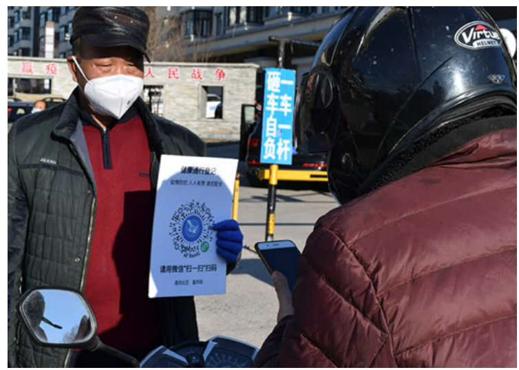
eer holds a sign with a QR code to indicate health status in Suifenhe, where only one member of usehold was allowed out every three days to buy food and other supplies

But now Suifenhe faces a real crisis, after Chinese nationals returning home from Russia triggered a much-feared <u>"second wave"</u> of infections. The city has more than 320 confirmed cases and almost 1,500 people in centralised quarantine facilities.