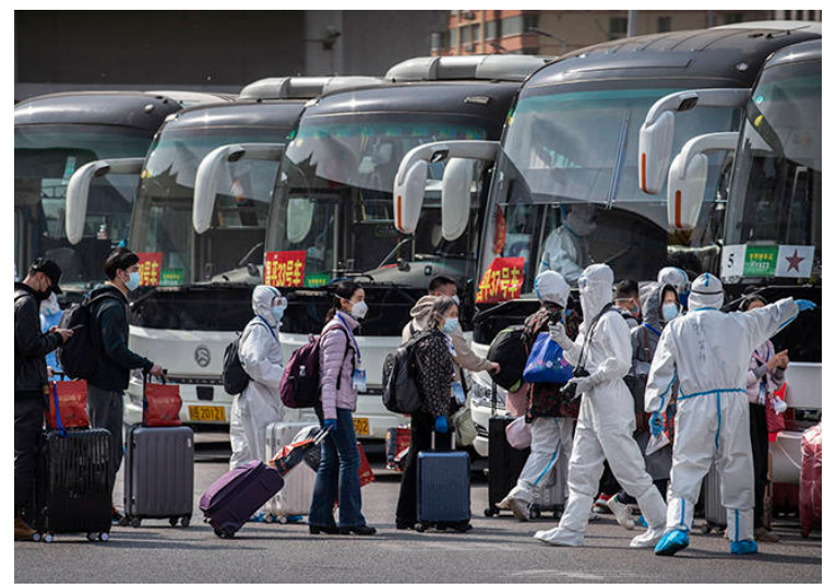
Chinese workers and health officials wear protective white suits as travellers from Wuhan gather to \iota into 14 days of quarantine after arriving in the capital

US sportswear company Nike said this week that 80 per cent of its China stores were open in cities such as Shanghai, which shows few visible signs of the pandemic. Car factories in Chengdu, capital of southwestern Sichuan province, have <u>restored operations</u> with little disruption, other than the use of face masks and other protective gear and social distancing in the canteen.