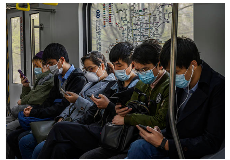
commuters in Beijing. Authorities in the capital are enforcing strict quarantine rules that make s travel to or from the capital impossible