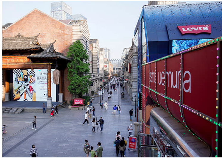
vearing face masks,walk near a shopping complex after the lockdown in Wuhan was lifted

Eswar Prasad, a China expert at Cornell University, says Friday's GDP numbers are "a bellwether of what the data for other major economies will reveal in the coming weeks". He adds that while the "apparent stabilisation" in recent indicators has provided "grounds for at least mild optimism, the magnitude of this collapse makes it even more puzzling how China's economy seems to be getting back on its feet despite the government's relatively modest stimulus measures thus far."