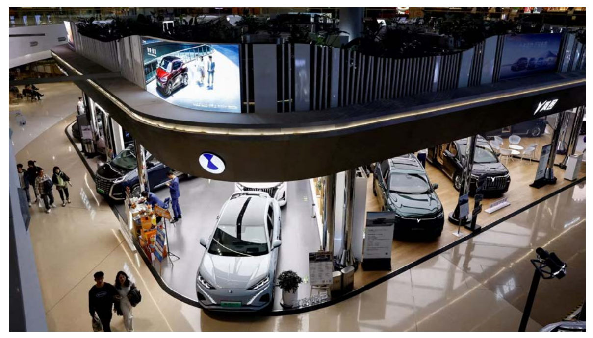
Economists say overcapacity in sectors such as electric vehicles is bringing down the cost of Chinese exports

World's second-largest economy has turned to trade to offset weak domestic consumption