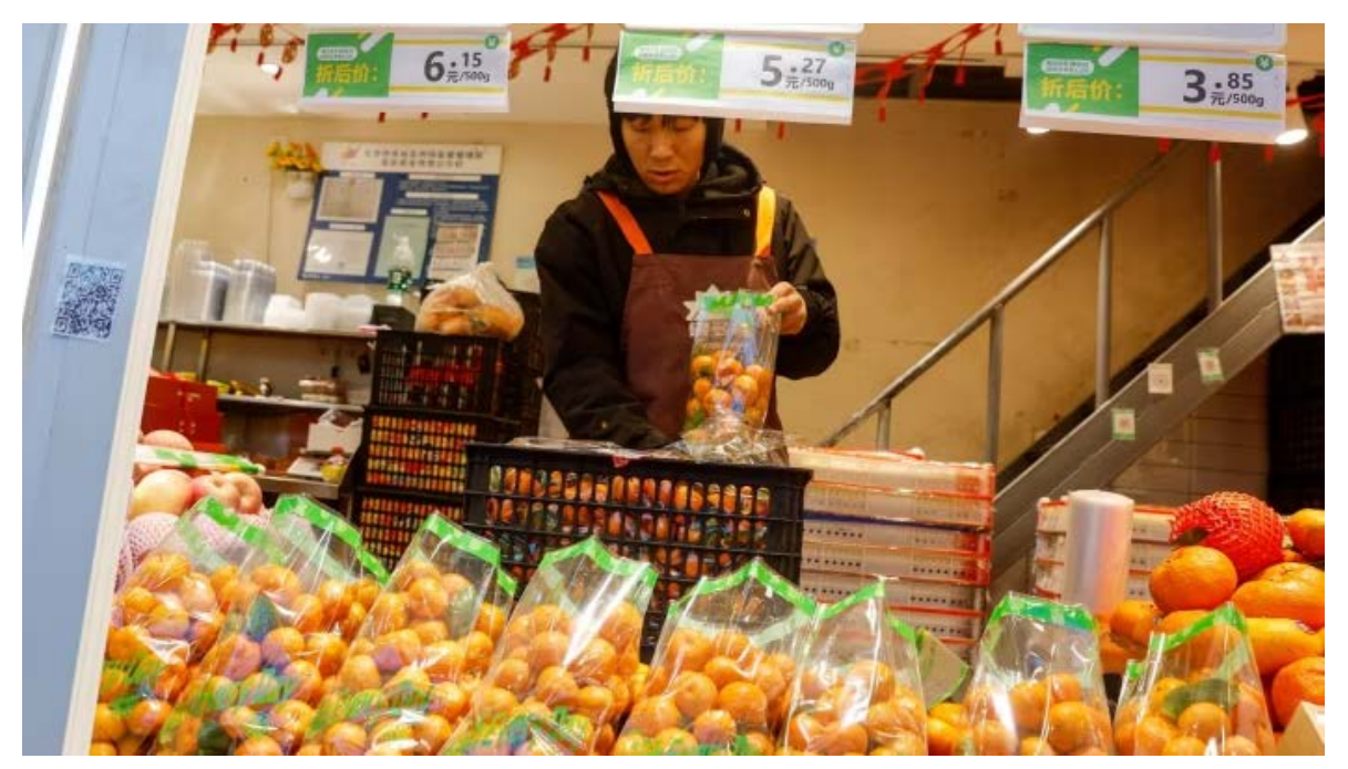
China's economy slipped into deflation in July, and prices have been flat or fallen in almost every month since then

Analysts warn prolonged price declines will undermine business and consumer confidence