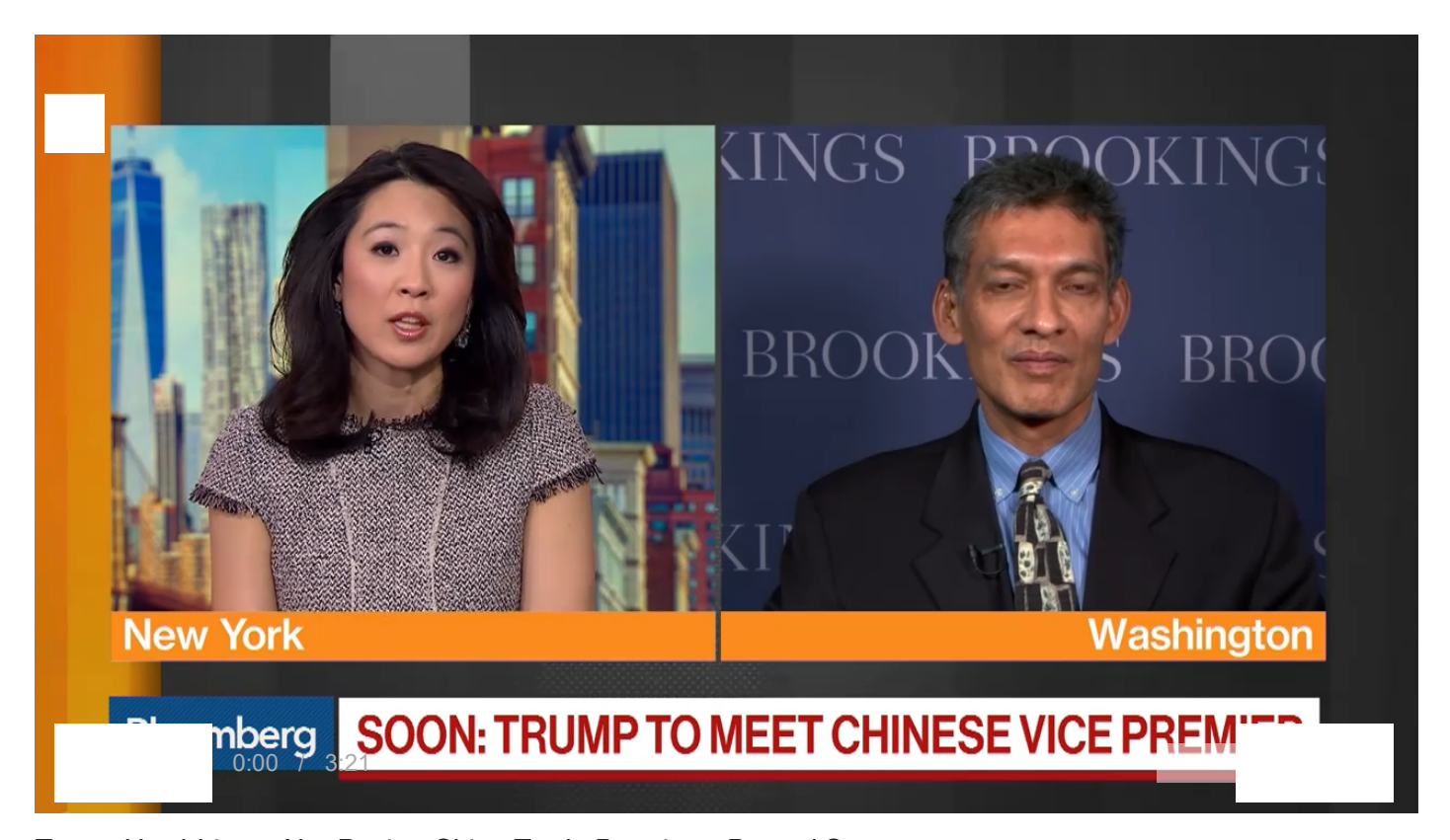
Trump Hard-Liners Not Buying China Trade Promises, Prasad Says

China promised to "substantially" expand purchases of U.S. goods after the latest round of trade talks, and both sides planned further discussions to reach a breakthrough with only a month to go before the Trump administration is set to ratchet up tariffs.