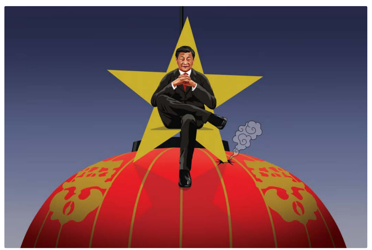
China is now too large an economy to export its way out of a downturn, Eswar Prasad writes. Illustration by Pete Reynolds

COMMENTARY By Eswar Prasad Aug. 9, 2023 11:35 am ET