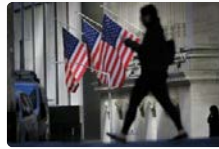
Stock market today