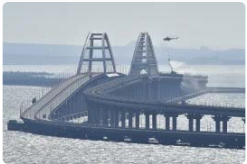
Russian bridge to Crimea attacked again