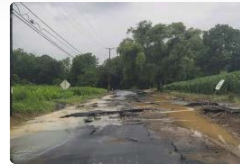
Deadly flash flooding in the Northeast